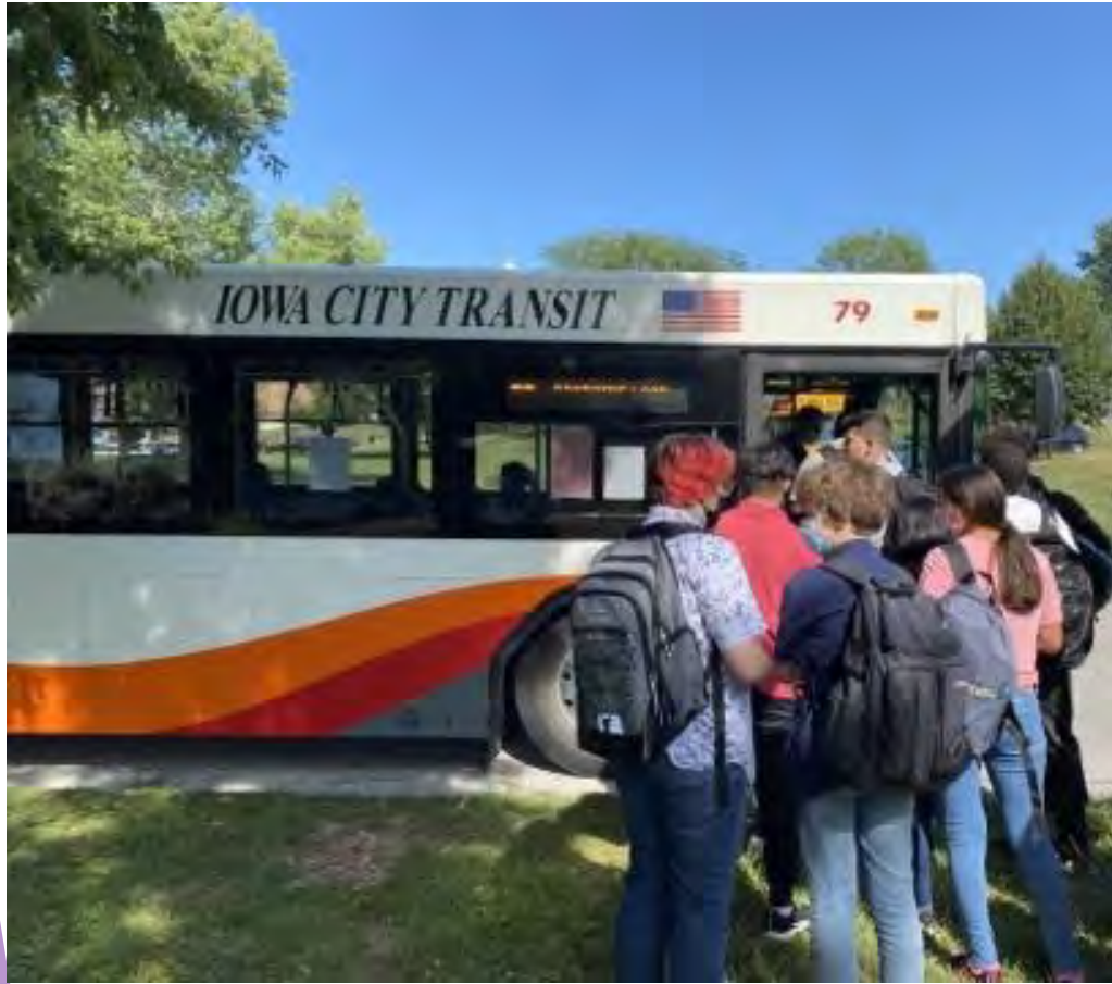
High School students riding the bus home from school