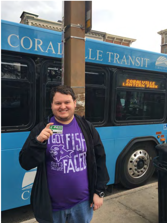
Person learning how to ride the bus to work