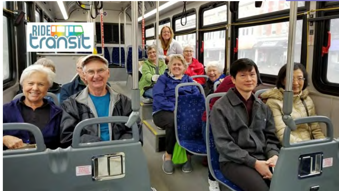
Seniors riding the bus to tour an old schoolhouse