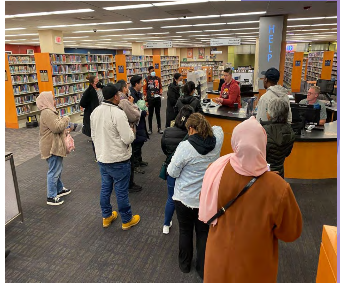
English Language Learners visiting the Iowa City Public Library which they traveled to by bus