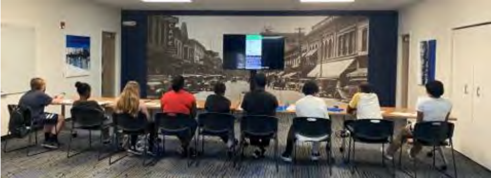
Youth learning how to use Transit App during summer programming